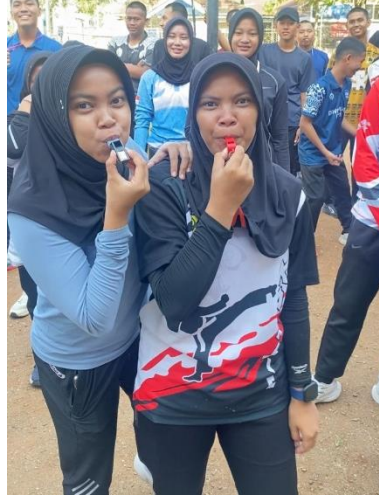
Figure 5. Students apply the correct whistle blowing as a volleyball referee.

Lambung Mangkurat University, Banjarbaru. Participants consisted of 100 Physical Education Students class of 2025. In addition, participants implemented the volleyball match rules that had been given by the resource person through referee signals both from valid match rules. In figure 5 below as follows.