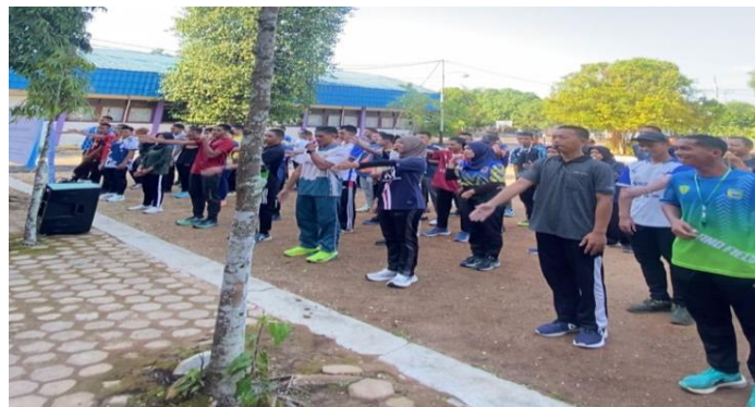
Figure 6. Students apply the referee's signals during service.

In Figure 5 above, the first step taken by the speaker was to provide an example of how to properly blow the whistle as a referee. After that, the students followed the technique. Next, the speaker provided further instructions, as shown in Figure 5 below.