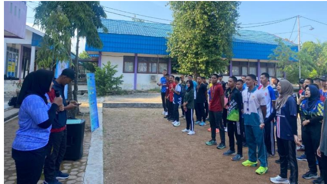
Figure 3. Presentation of volleyball match rules

Figure 2 above shows that 80% of the students are male and 20% are female students currently teaching volleyball in the physical education study program at Lambung Mangkurat University. Figure 2 below illustrates the speaker's presentation to the participants.