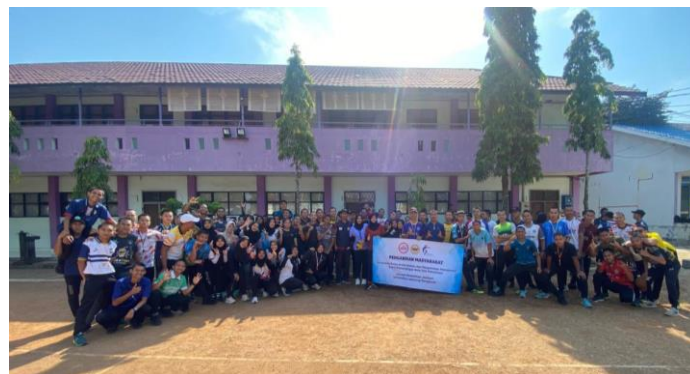
Figure 7. Documentation of activity participants, resource persons and community service team

In Figure 6 above, all students participating in the activity begin to apply the referee's signals for serving, line contact, passing, blocking, and smashing. This provides the foundation for learning the rules of volleyball.