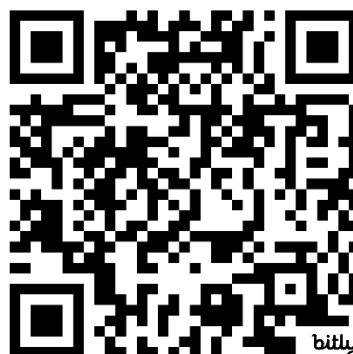
Figure 9. Barcode link video of the implementation of the internal volleyball

After the evaluation, as shown in Figure 8 above, many participants still wanted to learn more about volleyball rules to maintain their progress and were also interested in obtaining a volleyball referee license at both the regional and national levels. Therefore, the output of the volleyball course will not only be able to practice basic techniques and volleyball theory, but will also foster interest in pursuing a career in volleyball refereeing. Below is a video of the implementation of an internal tournament after participating in referee training in the barcode image below as follows