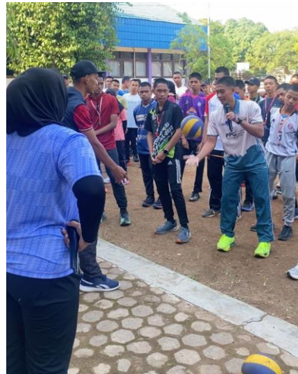
Figure 4. Question and answer process by participants to the resource person

The material presented by the resource person provided education regarding referee signals and volleyball match rules. Participants were given knowledge and taught how to blow the referee's whistle to distinguish between a referee's whistle and a non-referee's whistle. Additionally, they practiced referee signals for serving, passing, blocking, and smashing. This outreach was conducted to directly train participants and encourage them to participate in volleyball matches if they are interested in obtaining a referee license. Furthermore, many students enthusiastically participated in the activity, which included a question-and-answer session.