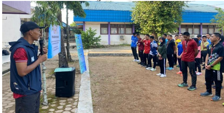
Figure 8. Evaluation of the Implementation of Community Service Activities

The evaluation stage is crucial for identifying the strengths and weaknesses of the activities undertaken. Participants' skills still require significant improvement to create more volleyball and other sporting events in the future, and to foster interest in obtaining volleyball referee licenses at both the regional and national levels. The challenge in this implementation is related to the lack of activities related to official licensing for volleyball referees. Through more sustainable implementation and implementation of activities that have the potential to increase the credibility of human resources, both within the student community and existing stakeholders. Referee licensing training will facilitate the performance of match officials in Banjarbaru City in the future. Successful event management begins with an understanding of the competition rules and a sufficient initial foundation for maximizing activities.