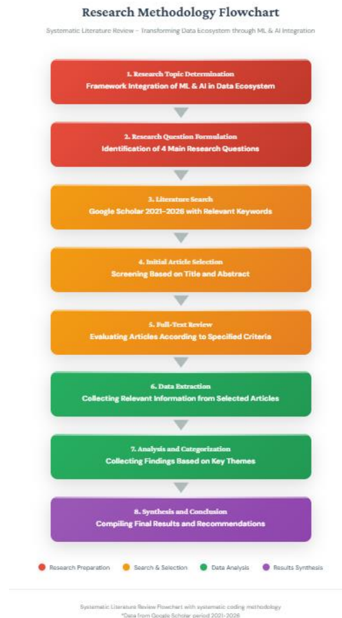
Figure 1. Flowchart of Systematic Literature Review

extracting data and collecting relevant information from selected articles, analyzing and categorizing findings to identify key themes, and synthesizing results to formulate conclusions and recommendations. This structured approach ensures comprehensive coverage and methodological rigor in examining innovative big data frameworks.